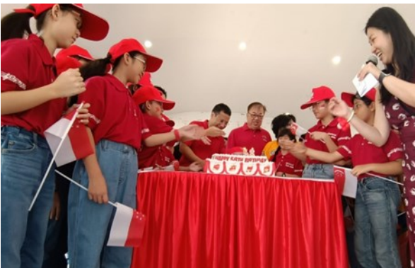
Choir members helping Minister Desmond Lee to extinguish candles on the cake.