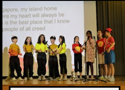
Our drama club members in action!