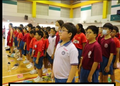
Students standing at attention for the Observance Ceremony