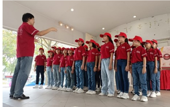
Qifa Choir performing at West Coast Vista Pavilion.