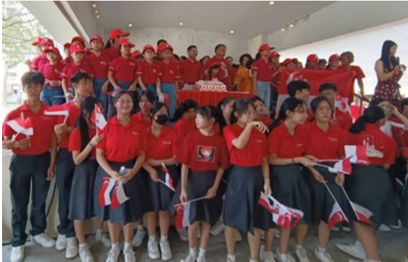
Choir members holding the Singapore flag during the singing of the National Anthem.

Our utmost appreciation goes to the families of our students whose unwavering support played a significant role in the success of these events.