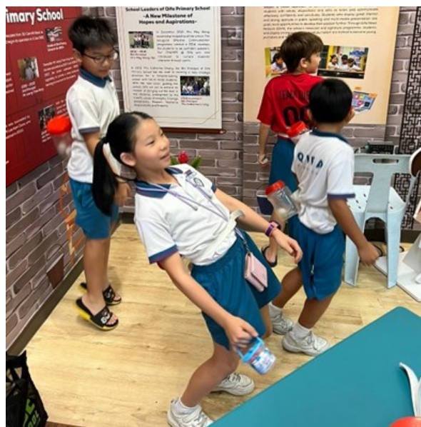
Learning positive online behaviours through gamification.