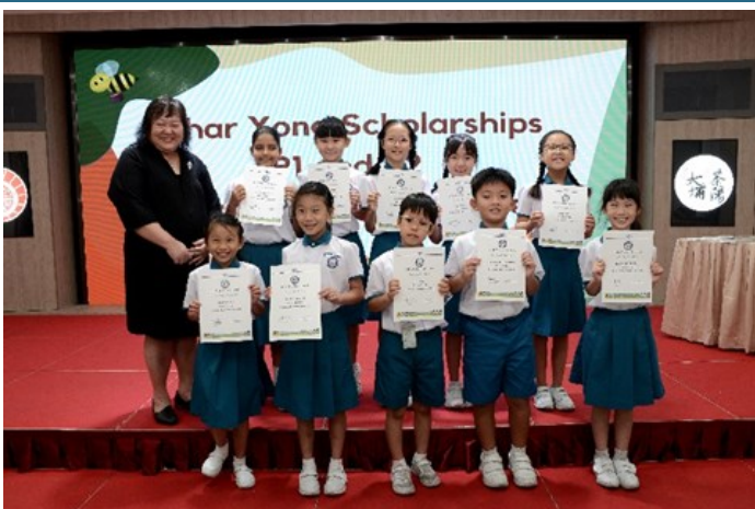
Exemplary Excellence 2022 (Primary 1 to 6)