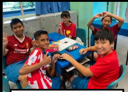
Collaboration during CCE (FTGP) Lessons