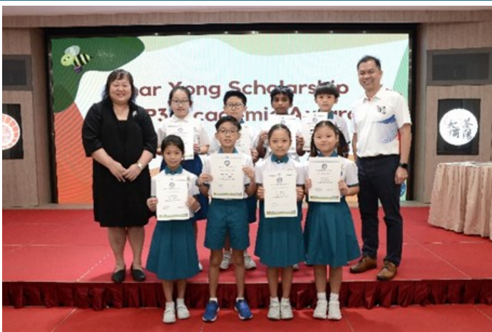
Top Primary 3 (2022) Academic Performance