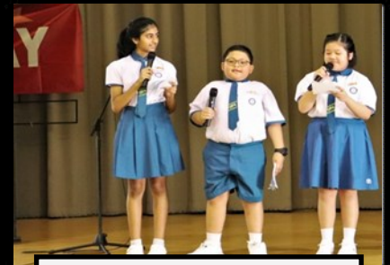
Our lovely student emcees!