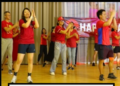
Our teachers leading "Dance of the Nation"