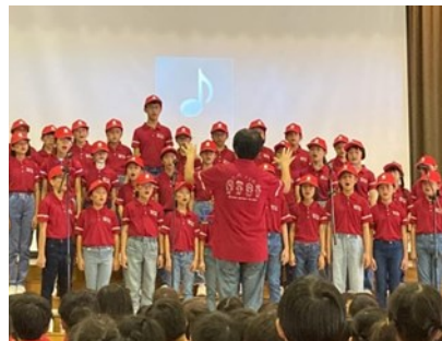
Choir's performance of the song, 隱形的翅膀, in the school hall.