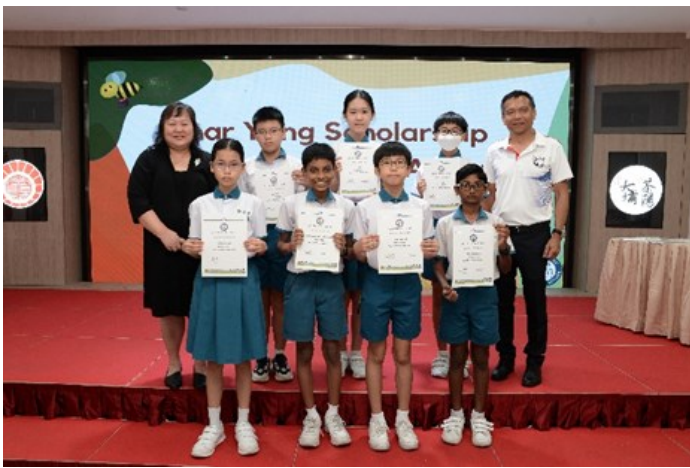
Top Primary 5 (2022) Academic Performance