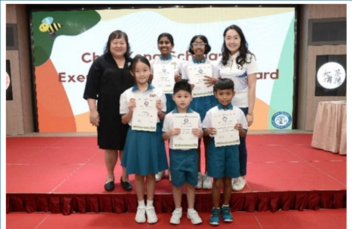
Exemplary Character Awards 2022 (Primary 1 to 6)