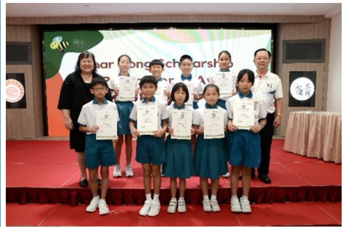
Top Primary 4 (2022) Academic Performance