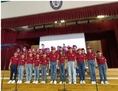
Choir's rendition of Bunga Sayang

On 8 August 2023, Qifa Choir performed at the school's National Day celebration. The choir members took the lead in the National Day songs sing-along session. The members, adorned in coordinated red Choir T-shirts and caps, exhibited tremendous enthusiasm and confidence during the performance.