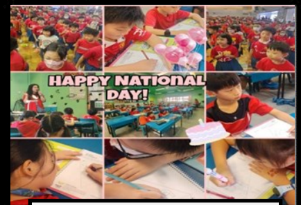
"Onward As One!"