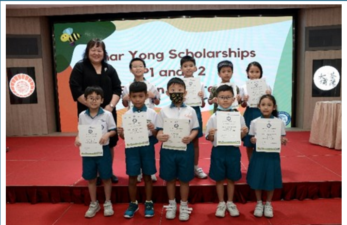
Best in Progress (Primary 1 and 2)