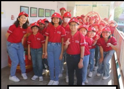
Our Choir members and Teachers-in-Charge