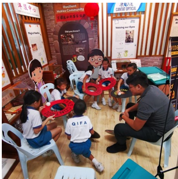
Take Control! Be a master of games, Not to be mastered by games.

With greater awareness, we hope that our students will practise balanced, respectful and informed online behaviour!