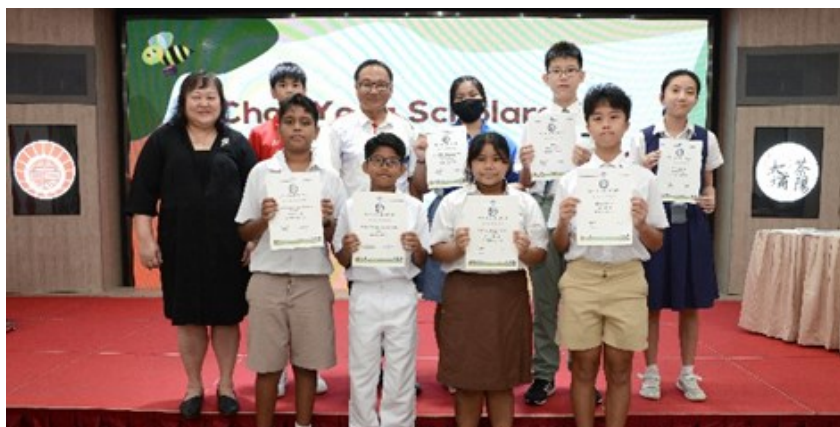
Top PSLE 2022

On 29 July, the Char Yong Scholarships Ceremony 2023 was held at Char Yong Association. In recognition of outstanding achievement in character excellence and academic performance, a total of 67 scholarships were awarded to Primary 1 to 6 students from the 2022 cohort. Many parents graced the occasion to lend their support to their children, signifying a strong home-school-community partnership that the school strives to sustain.