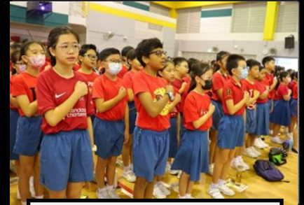
Students reciting our Pledge