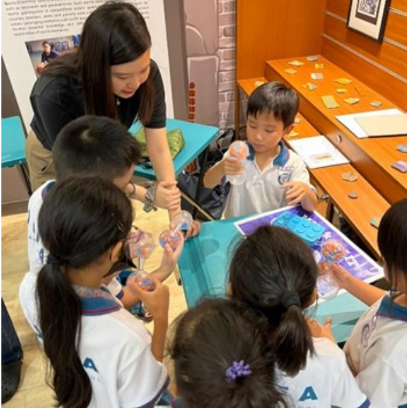
Learning how to manage online information