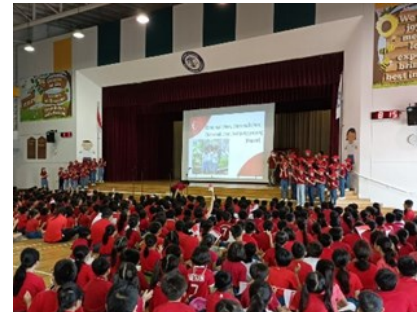
Choir leading the school in the Sing-Along segment of the National Day celebration program.

On 12 August 2023, Choir had an invaluable opportunity to perform at the National Day Celebration hosted by the West Coast Vista Residents' Committee at Blk 731 Clementi West Street 2. This event, dedicated to our nation's pride and unity, welcomed our esteemed Guest-of-Honour, Minister Desmond Lee and enthusiastic residents from across the constituency.