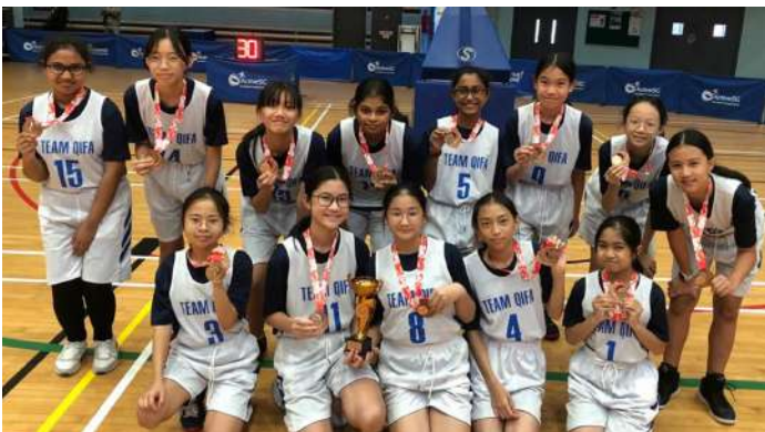
Our Senior Girls hiding their tears of joy.