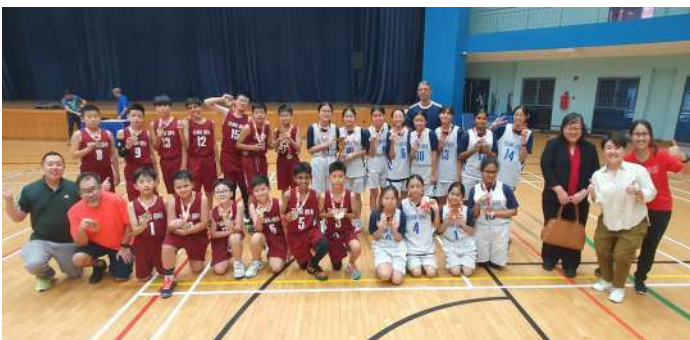
A unique experience at the Jurong East Sports Hall.