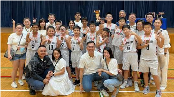
Our Senior Boys and the parent contingent