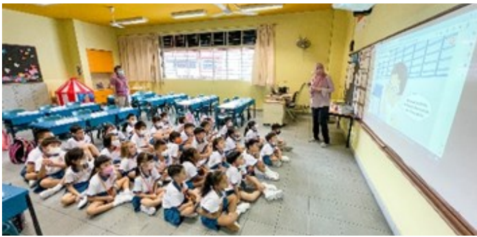
Big book reading