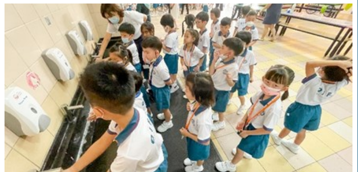
Washing hands before recess