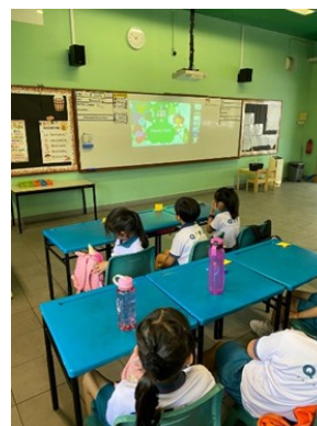
Dettol – Hygiene Quest