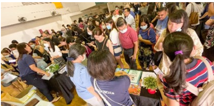
Parents at the hall