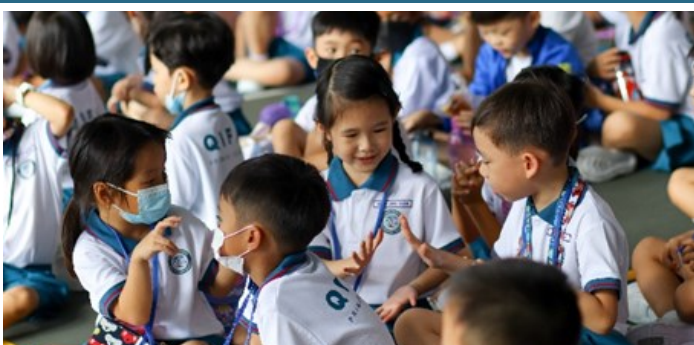
At the lower indoor sports hall after recess