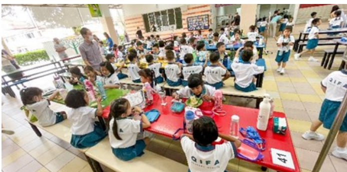
Time for recess!