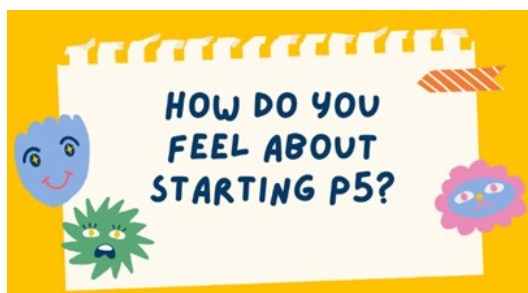
Check in lesson