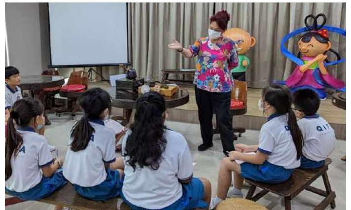
Our students learnt the art of Chinese tea appreciation – making it, serving it and consuming it with the right etiquette.