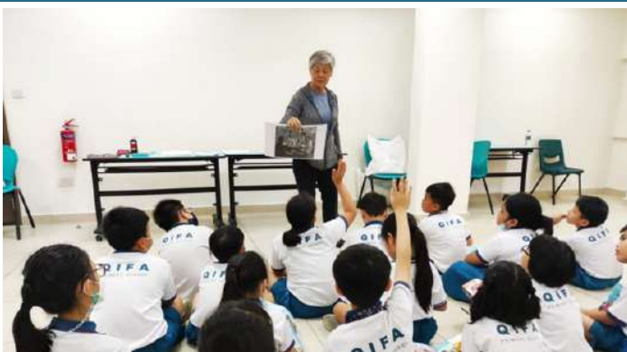
Glimpses into the past – how did these immigrants communicate with their families back home when there were phones and most could not read or write?