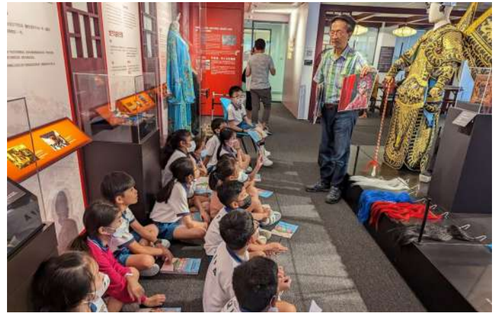
The significance of the colours and the costumes used for Chinese Opera is indeed fascinating.