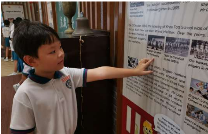
Wow! Wonderful English drama performance of Qifa students