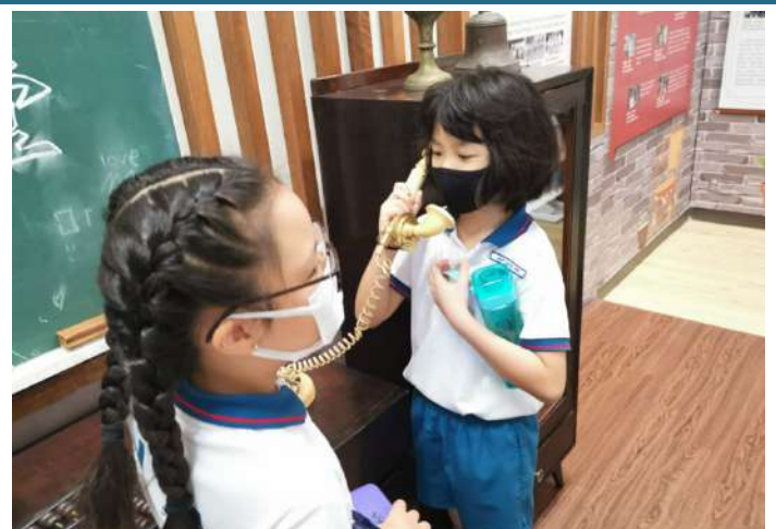
Talking to her friend using a telephone from the past!