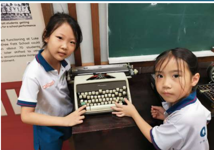
We used to have a typewriter!