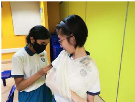
Demonstrating First Aid Skills by the NE Ambassadors

Throughout this challenge, our NE Ambassadors showed tremendous teamwork, dedication, and enthusiasm, which saw them emerge as one of the top 8 schools. Well done NE Ambassadors!