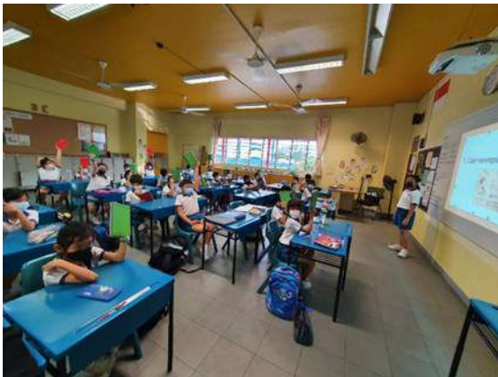
Student leaders educating their peers on recycling

In 2022, our Values-In-Action Ambassadors and teachers raised awareness about recycling and energy conservation through engaging presentations for the students. In addition, our Primary 3 students created beautiful recycling boxes to encourage recycling within the classroom.