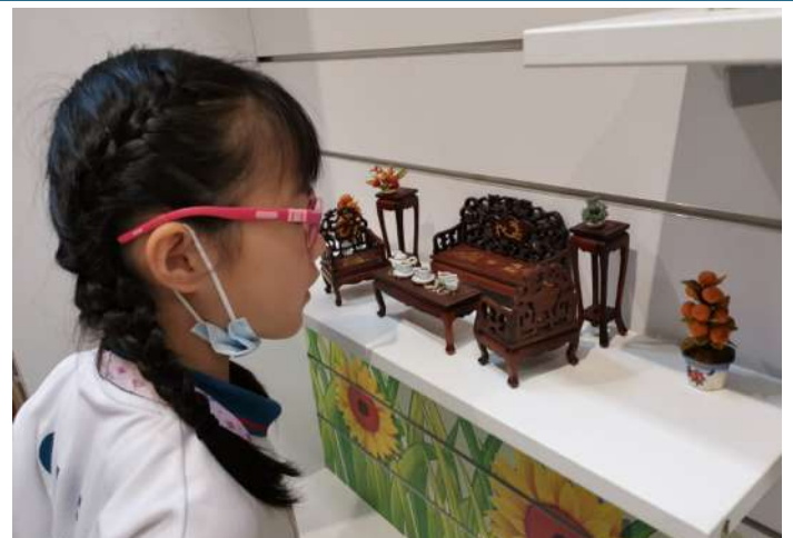
These are the Hakka community's home furniture set.