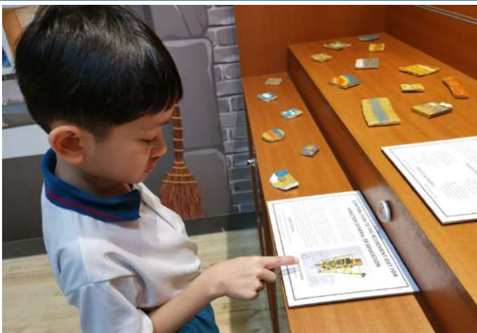
Lovely artefacts made by our schoolmates