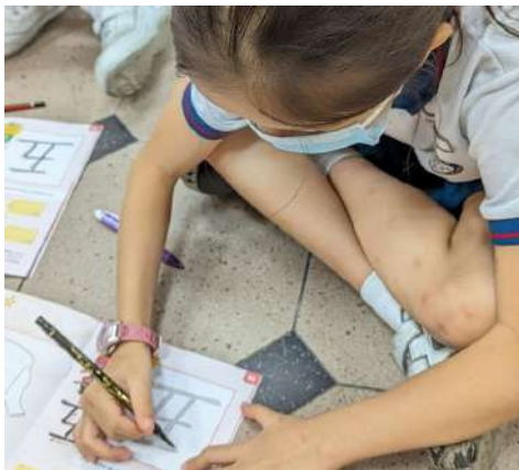
To become a master at calligraphy, you first have to practise, practise and practise.