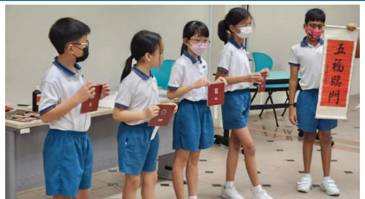
We left feeling blessed indeed for all the good fortune that has been bestowed upon us.