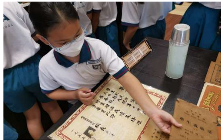
Now I know how a school leaving certificate looks like in the past!