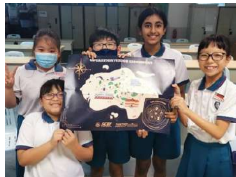
Completion of the Team Challenge