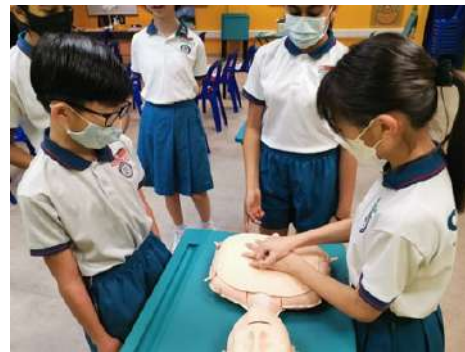
Let me show how CPR can be done!