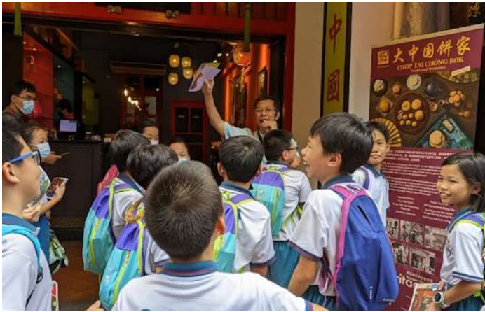
Our students enjoying their tour of Chinatown.